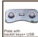
Plate with backlit keys+ USB