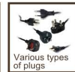
Various types of plugs