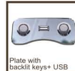
Plate with backlit keys+ USB