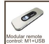
Modular remote control: M1+USB